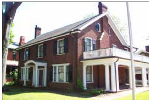
North Carolina UDC Headquarters 302 North Blount Street, Raleigh

Sponsored by the Captain James Iredell Waddell Chapter 32, Raleigh