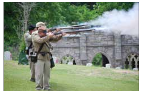
Members from the 6th & 26th NC Regiments providing an infantry salute to the Confederate dead.