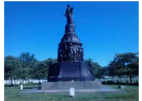
The Confederate Monument, Arlington Cemetery