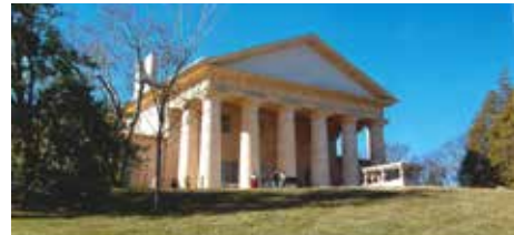
Lee Mansion, Arlington Cemetery