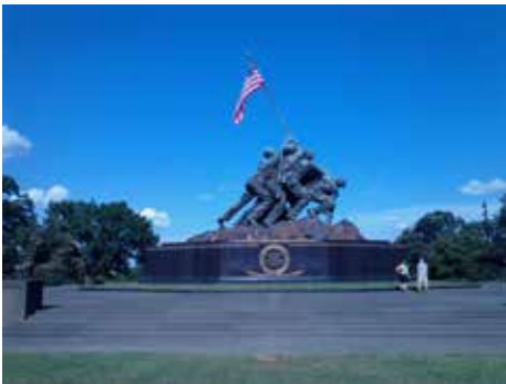
Iwo Jima Memorial, adjacent to Arlington Cemetery