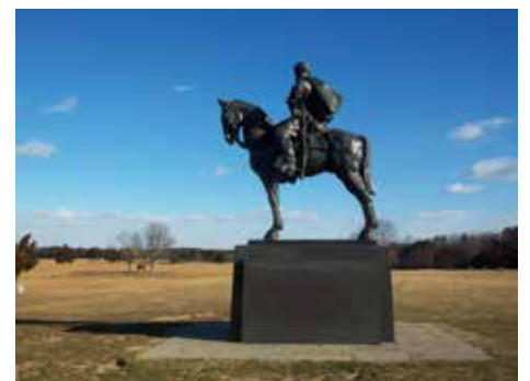
Statue of Stonewall Jackson at Manassas National Military Park