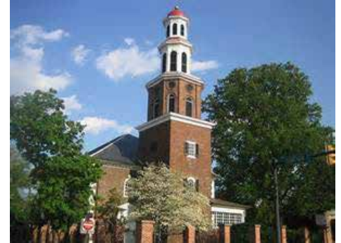
Christ Episcopal Church, Alexandria, where both George Washington and Robert E. Lee had designated pews