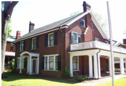
North Carolina UDC Headquarters 302 North Blount Street, Raleigh

Hosted by the Capt. James I. Waddell Chapter No. 32, Raleigh