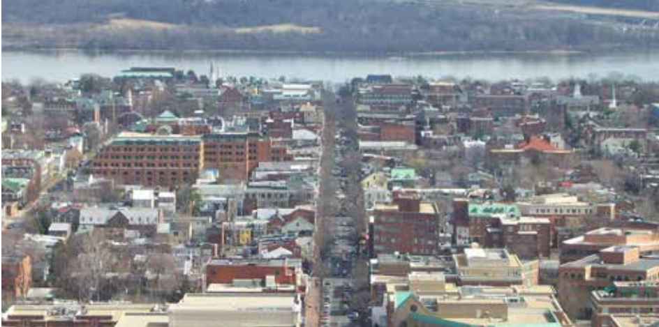
Historic Old Town Alexandria, Virginia

ALEXANDRIA, VA —Make your plans now to attend the 2015 MOS&B National Convention to be held at the Hotel Monaco in Old Town Alexandria. Set for July 11-14, 2015, the convention will feature business sessions, Awards Luncheon, Prayer Breakfast, and several tours of area sights such as Arlington National Cemetery and other sites in the historic Alexandria area. Registration forms are available on the MOS&B web page.