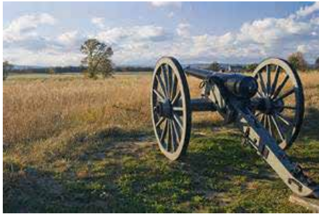
Seminary Ridge - Gettysburg

The 37th engaged the enemy and pushed them back to Seminary