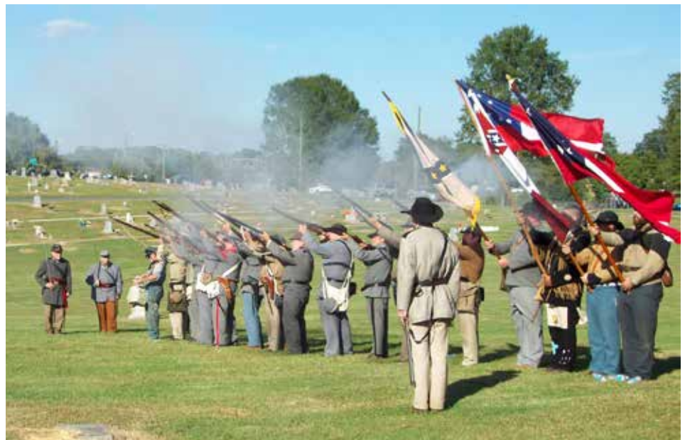
The 16th South Carolina Volunteers Confederate Honor Guard provided the colors and military musket salute for the ceremony.