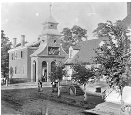
Hanover Court House