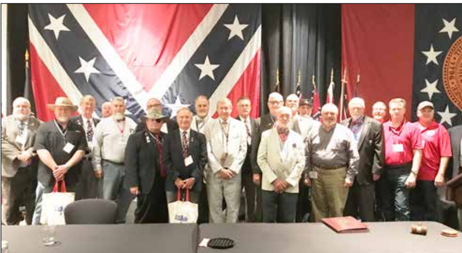
Members of the MOS&B at the SCV Reunion in Franklin, Tennessee. There were more than 40 members from across the Order in attendance.