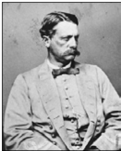
Captain James Iredell Waddell Confederate States Navy

Official publication of the Captain James Iredell Waddell Chapter No. 32, Military Order of the Stars and Bars, Raleigh, North Carolina since 1988