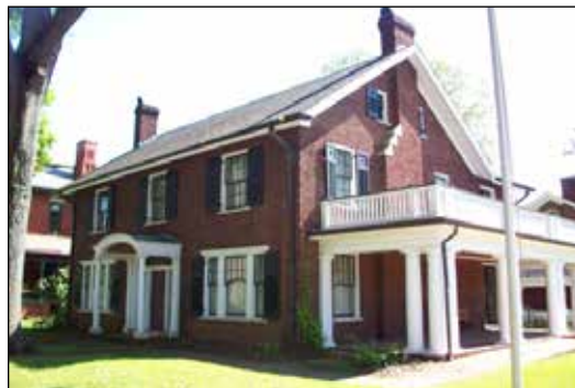
North Carolina UDC Headquarters 302 North Blount Street, Raleigh

Hosted by the Captain James Iredell Waddell Chapter No. 32, Raleigh