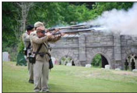
A Confederate infantry salute featured the Cedar Forks Rifles, Company I, 6th NC Troops and the 26th Regiment NC Troops. Company B, 3rd Battalion, Edenton Bell Battery are shown firing an artillery salute to the Confederate dead.