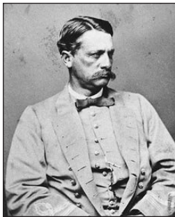
Captain James Iredell Waddell Confederate States Navy

Official publication of the Captain James Iredell Waddell Chapter No. 32, Military Order of the Stars and Bars, Raleigh, North Carolina since 1988