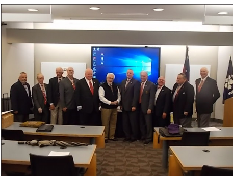
Members of the MOS&B General Executive Council attending their October 20, 2018, meeting at the Bryant Conference Center on the campus of the University of Alabama at Tuscaloosa.