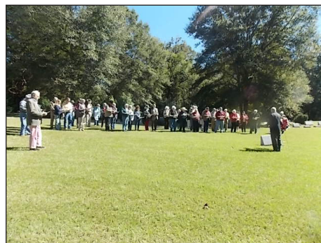
A memorial service was held at the Bethsalem Presbyterian Church on Sunday in Boligee sponsored by the General Gorgas Chapter 299, Tuscaloosa, Alabama.