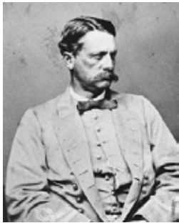
Captain James Iredell Waddell Confederate States Navy

Official publication of the Captain James Iredell Waddell Chapter No. 32, Military Order of the Stars and Bars, Raleigh, North Carolina since 1988