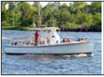
not actual boat