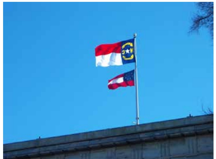
The Stars and Bars is shown over the dome of the NC State Capitol during the Lee Celebration in Raleigh on January 17th.