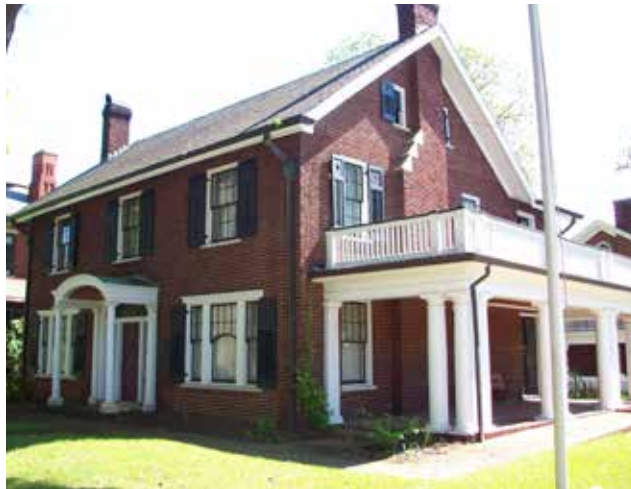
North Carolina UDC Headquarters 302 North Blount Street, Raleigh

Hosted by the Capt. James I. Waddell Chapter No. 32, Raleigh