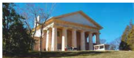
Lee Mansion, Arlington Cemetery