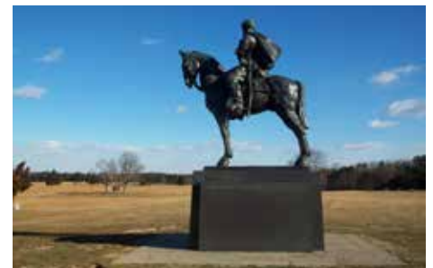
Statue of Stonewall Jackson at nearby Manassas National Battlefield Park