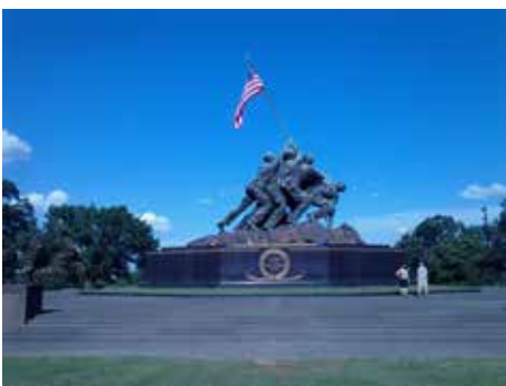
Iwo Jima Memorial, adjacent to Arlington Cemetery