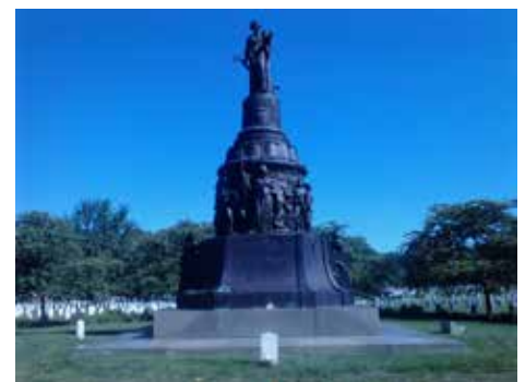
Confederate Monument, Arlington Cemetery