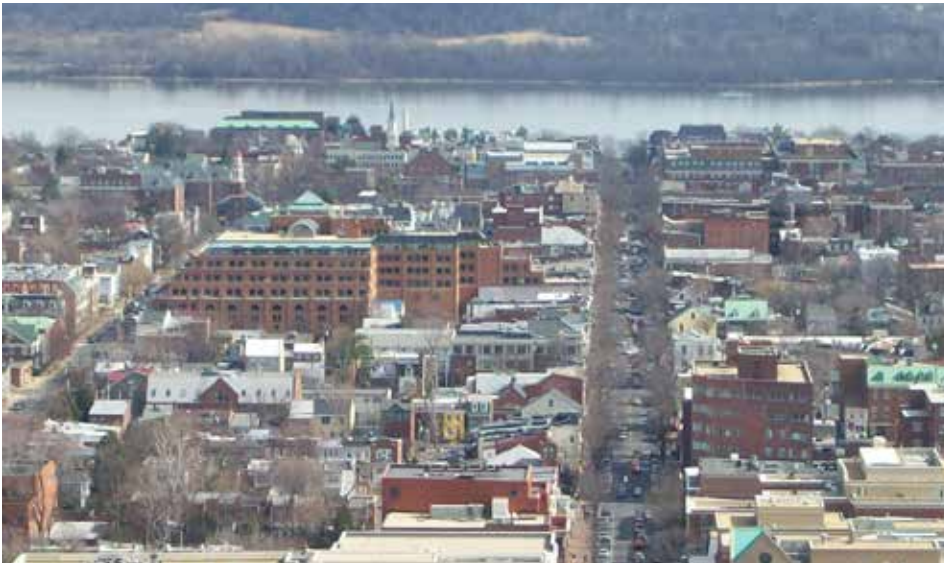
Historic Old Town Alexandria, VA.

http://www.militaryorderofthestarsandbars.org/2015-convention/