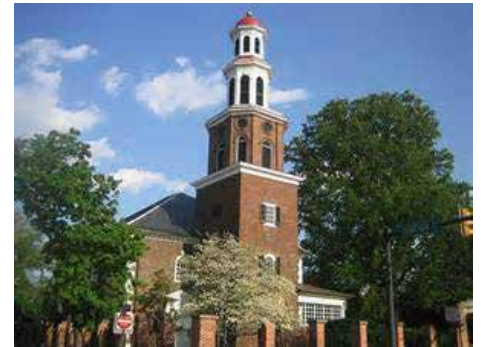
Christ Episcopal Church, Alexandria, where both George Washington and Robert E. Lee had designated pews.