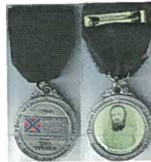
Obverse (Front) Reverse (Back)